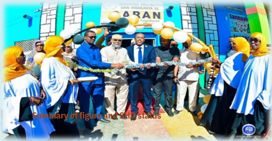
Summary of figure and SHG status

The self-help group program has successfully promoted in six regions of Somaliland (Awdal, Maroodi-Jeex, Sahil, Togdheer, Sool and Sanaag) and 12 SHG promoting organization form and build the capacity of self-help groups. The self-help group approach is a bottom-up approach which builds on peoples' existing capabilities and strengths. It is an empowerment approach which prioritizes the building and strengthening of a poor woman by forming three levels of which interacts. It also founded on the rights-based principles that facilitate an atmosphere where an individuals and communities can realize their potential and work towards their own evolution.