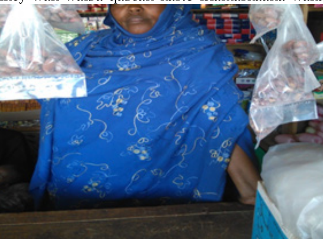
uu ku maal geliyay lacag dhan 300.000 S/SH.

iney wax walba qabsan karto islamarkaana waxa