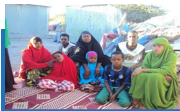
ama bilo, lacagtaasina waxba kagama dhacdo masaariifka reerka.

Talo waxay ku soo ururtay inay caruurtii dugsiga waxbarashda ka soo saarto oo qaarna kirishbey noqdaan, qaarna kuuli oo sameeyaan wax kasta oo ay wax ku soo saari karaan. Qaar iyaga ka mid ihi waxey ururin jireen jeega Ayaha I (Faluuja) kaasi oo ay ka iibin jireen isrogooyinka. Laakiin hawshaasi ma dhib yara, oo waxay ku qaadan jirtay tobobaado