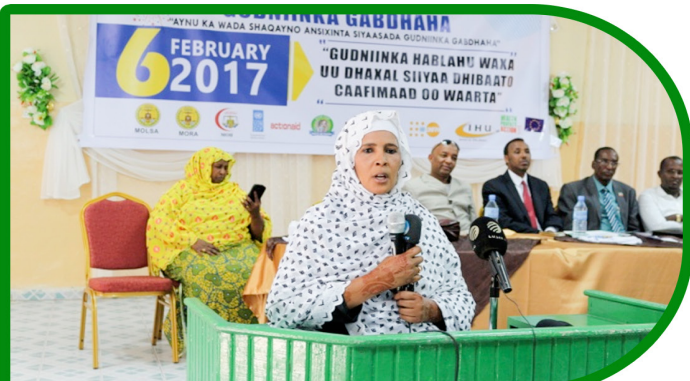
NAFIS Chairperson speaking on 6th February International day of Zero Tolerance to FGM/C