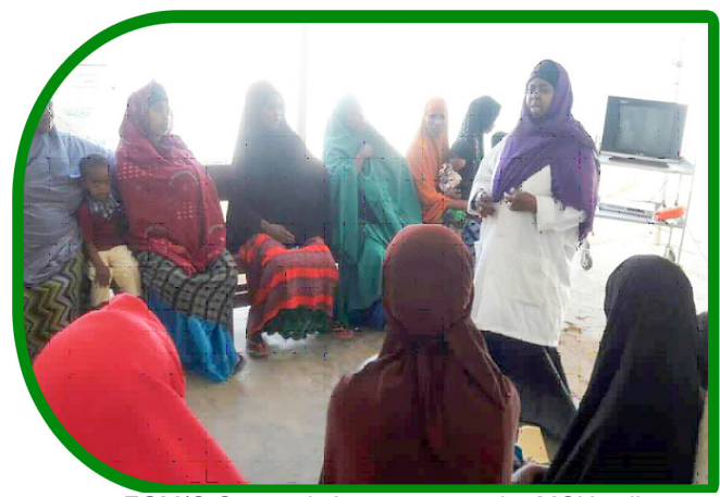
FGM/C Outreach Awareness to the MCHs clients