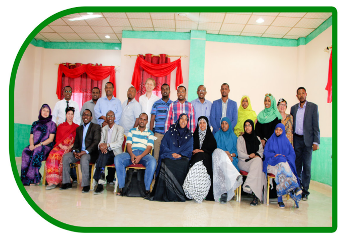
Strategic Meeting with ISF delegation and partners in Burao