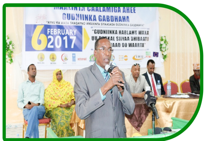
6th February International day of Zero Tolerance to FGM/C