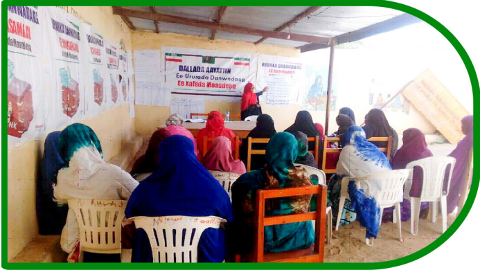
Capacity building training for CLA and SHG members

Advocacy meeting for Religious leaders in Hargeisa