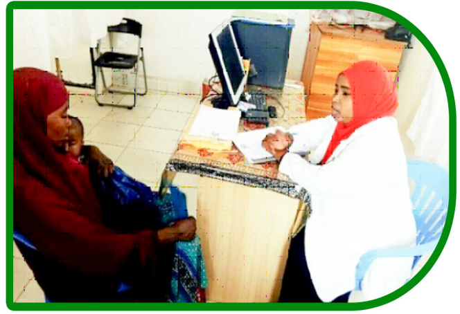
FGM/C Counseling Support